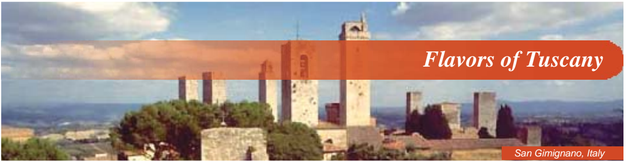
San Gimignano, Italy