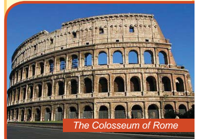
The Colosseum of Rome

Day 9: Breakfast at your hotel • Transfer to the airport fly home