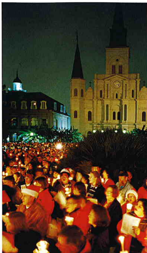
Candlelight caroling at St. Louis Cathedral

There's no place like New Orleans for the holidays. Celebrate the spirit of a city aglow with twinkling lights, festive iron-clad balconies and garland-decked streetcars. Converse with Historical characters as they stroll the streets of the Vieux Carre (French Quarter) and share their love of this wonderful city. New Orleans is alive with activities from live cooking demonstrations with local chefs and richly decorated historic