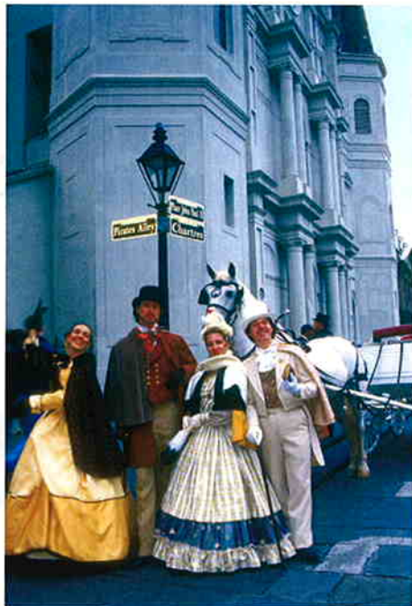
Charles Dickens characters in Jackson Square

W elcome to Christmas New Orleans style! Experience the magic of the holiday season in a city steeped in traditions of the past with food, music and good times of today.