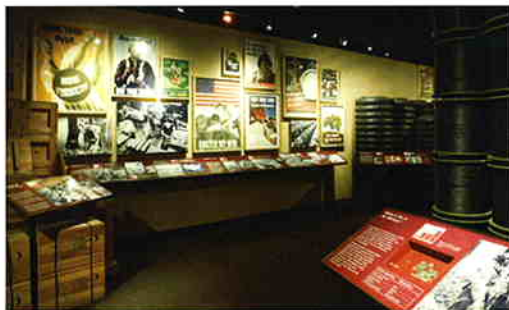
National WWII Museum

Dedicated in 2000 as The National D-Day Museum and now designated by Congress as the country's official World War II Museum, this remarkable attraction illuminates the American experience during the WWII era. Celebrate the American Spirit as you experience moving personal stories, historic artifacts and powerful interactive displays. From the Normandy invasion to the sands of Pacific Islands, the Museum salutes the optimism, courage and sacrifice of those who won the war and changed the world.