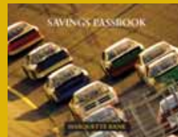
■ Race Cars